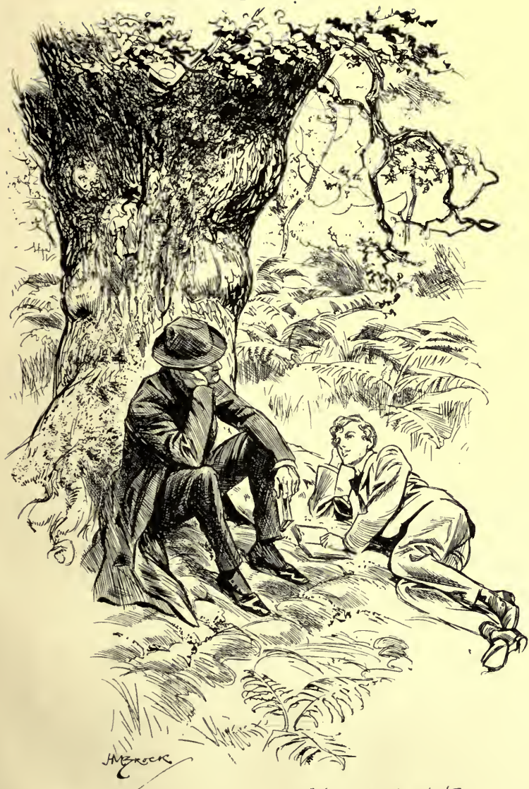
Under an old oak tree